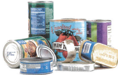
Food & Beverage Cans Steel, tin & aluminum soda, vegetable, fruit & tuna cans