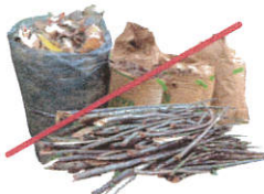
NO Green Waste