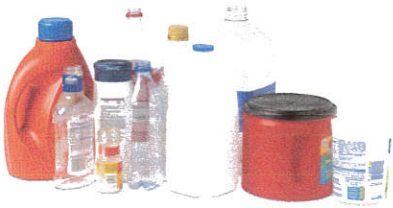
Plastic Bottles, Jars, Jugs and Tubs