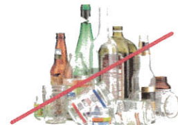
NO Glass Bottles & Containers

Empty recyclables directly into your bin.