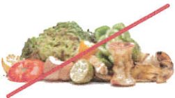
NO Food or Liquids