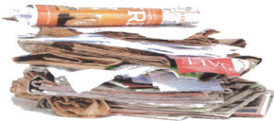
Paper Brown paper bags, non confidential office paper, newspaper, magazines