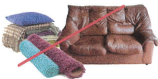
NO Clothing, Furniture & Carpet