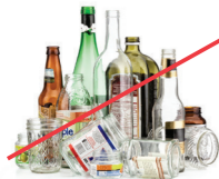
NO Glass Bottles & Containers