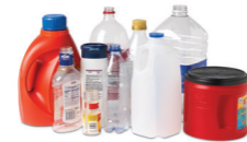
Plastic Bottles, Jars & Jugs (narrow neck containers labeled #1 and #2)