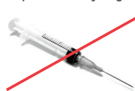
NO Needles (Keep medical waste out of recycling. Place in safe disposal containers like Waste Management's MedWaste Tracker® box.)