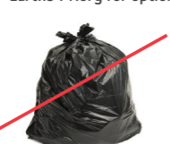
NO BAGGED RECYCLABLES